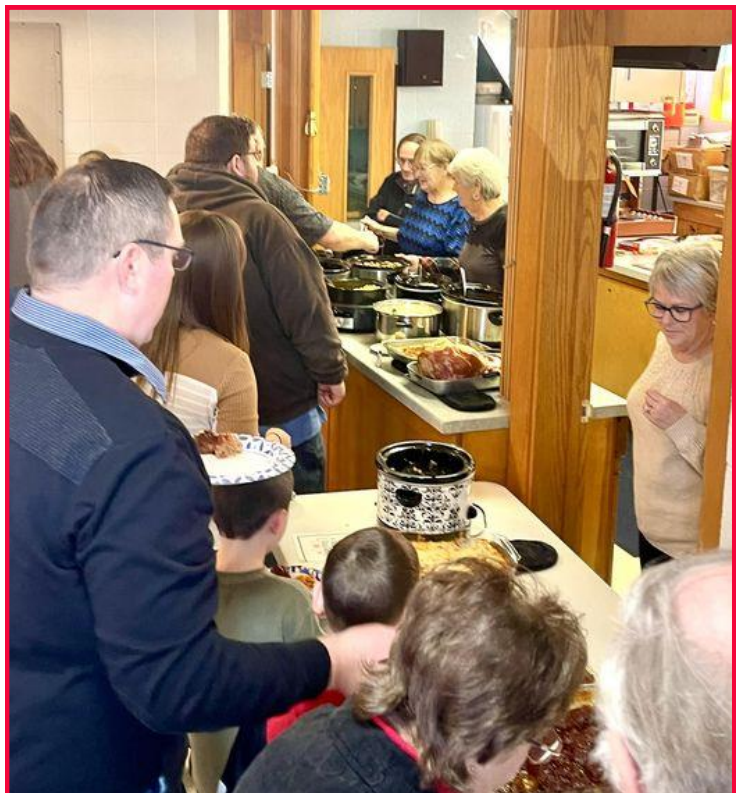
Our Annual Meeting and Potluck took place January 2st.